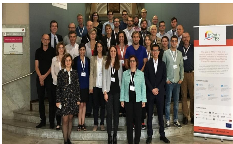
INPATH-TES Consortium at University of Lleida, Spain during the 4th General Board Meeting, October 2016